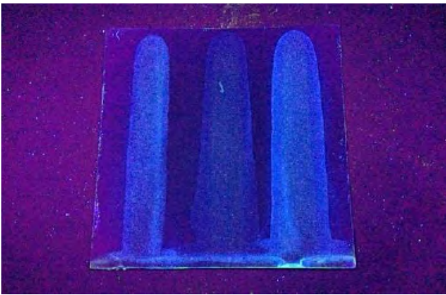
Left: Competitor A; Center: Magnaflux; Right: Competitor B