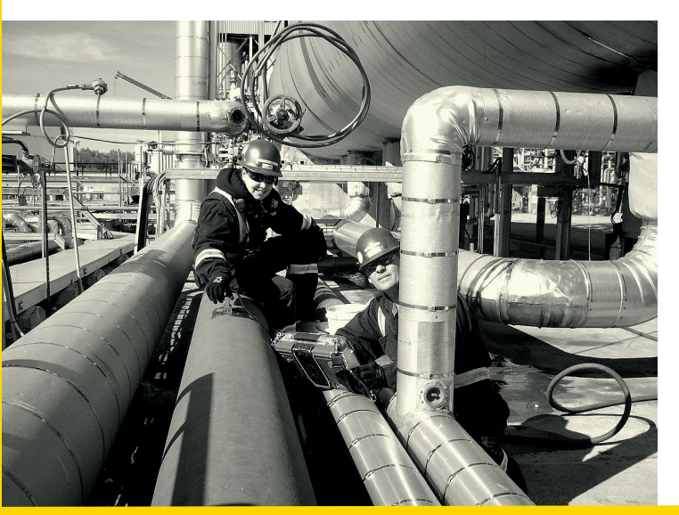
128 Channels Multi-scan